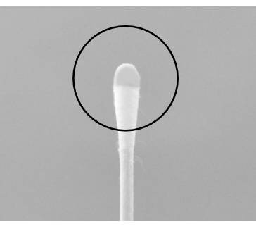
Successful cotton swab after taking simulated throat sample.

Training to insert cotton swab to the oral cavity while using tongue depressor can be practiced.