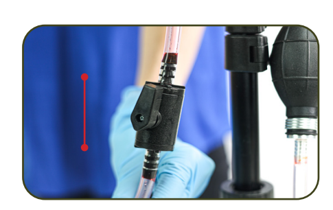
Valve ON POSITION : Inline with tubing