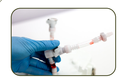
Tissue Holder Drain Tube